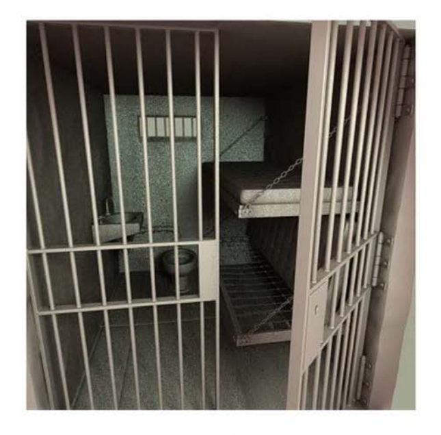
Training Mentors for Returning Citizens